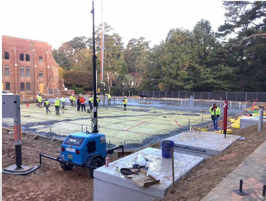
New addition slab on grade