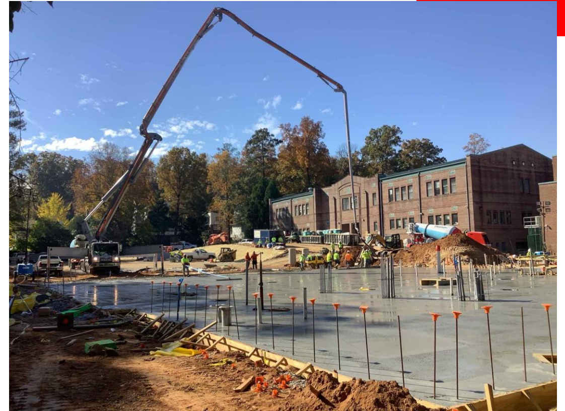
New addition slab on grade