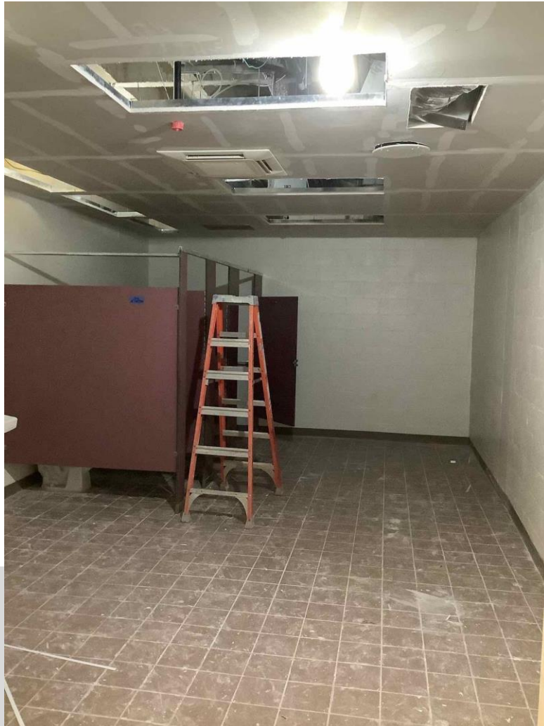
Restroom hard ceiling install