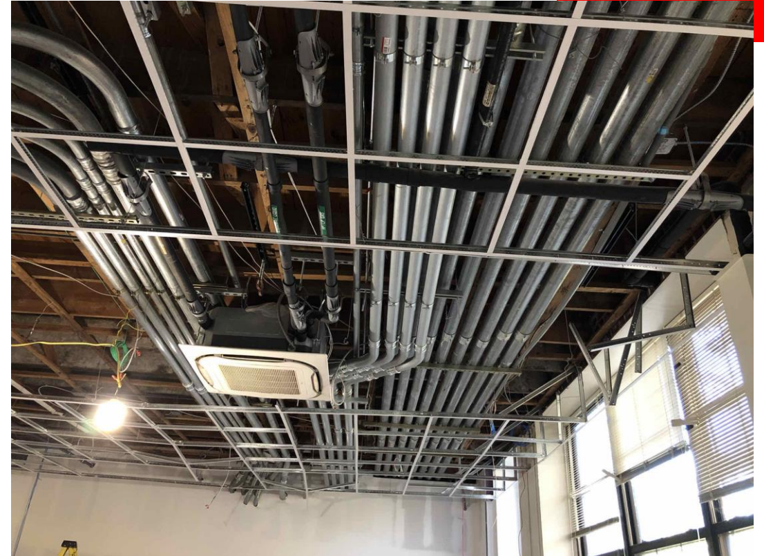
Electrical conduit install