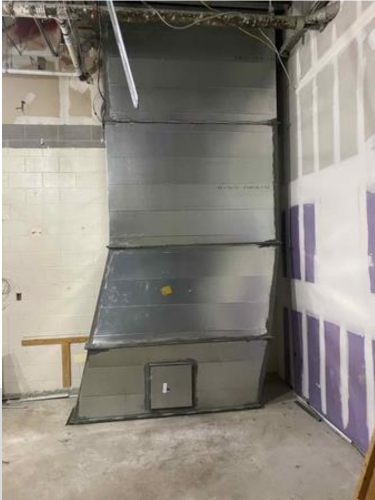
Garage exhaust duct install