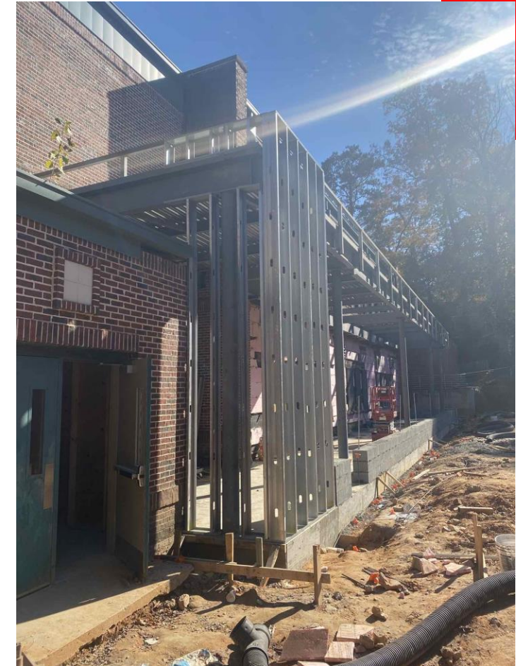
Exterior metal studs at cafeteria